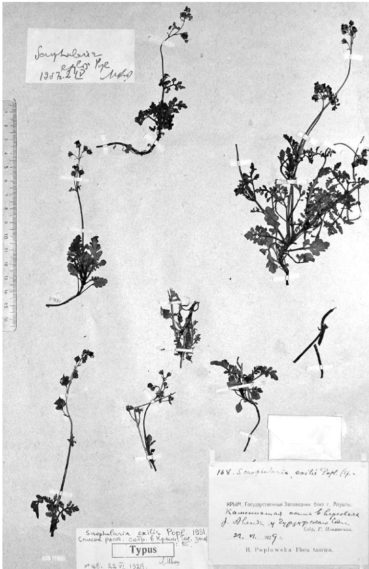
Fig. 2. Holotype of Scrophularia exilis at LE.

on the slope of Mt Shagan-Kaya in the Crimean Nature Reserve, 44°34'44"N, 34°13'36"E, 1345 m, 11 Jun 2012. Both localities were on east-facing rocky scree slopes (Fig. 1A) formed of fragments of Jurassic limestone and divided into relatively stable parts and mobile parts (Fig. 1B). The plants of S. exilis grew only on the mobile parts in three areas (c. 200, 800 and 850 m 2 ) on Mt Djunyn-Kosh and one area (about 2400 m 2 ) on Mt Shagan-Kaya. There were more than 400 individuals on Mt Djunyn-Kosh and more than 700 individuals on Mt Shagan-Kaya.